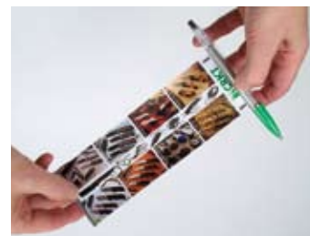
On the other side there's a display of hot new products.