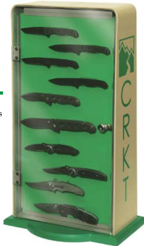
Locking Spinner Z2052 has a small footprint, yet displays many CRKT models.