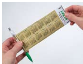
On one side there's a complete calendar for 2008.