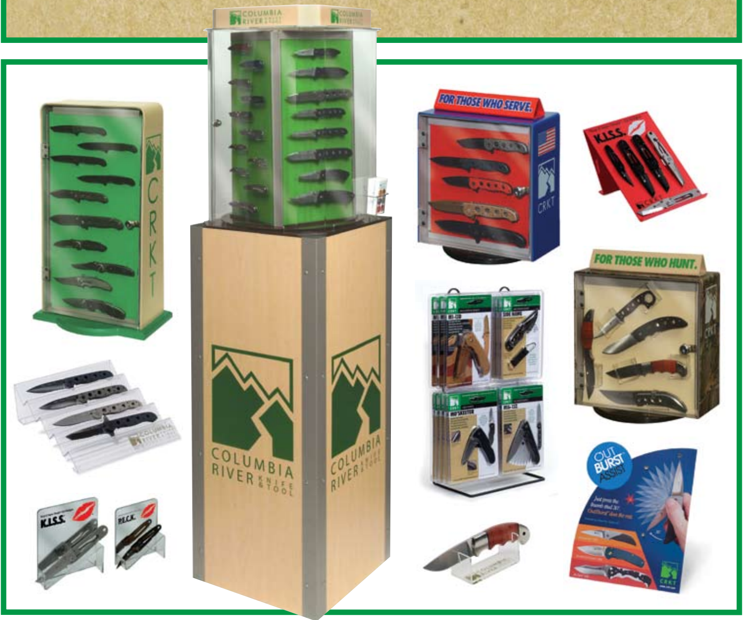
Retail Displays and Merchandising Materials